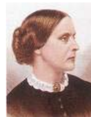
Susan B. Anthony